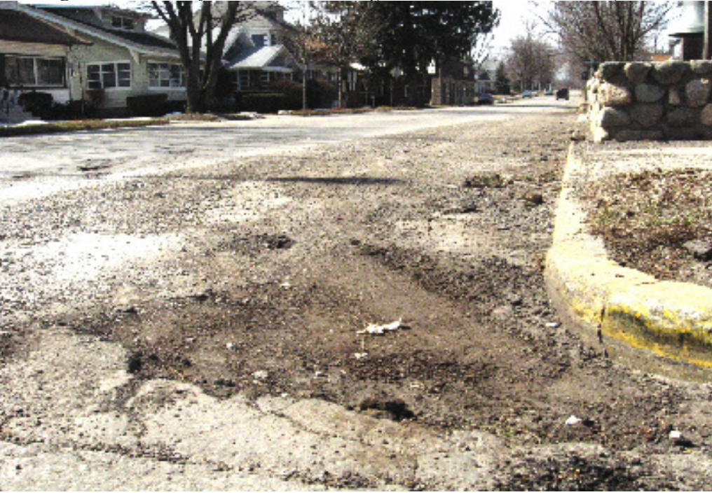
Potholes like this one, on Lake Shore Drive near State Street -- and how to handle repaving of them are causing headaches for the town of Culver, and were a central topic at the March 11 town council