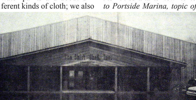
Shirt Shed in 1983

houses D.W. Wallcovering in the 1990s and is now home