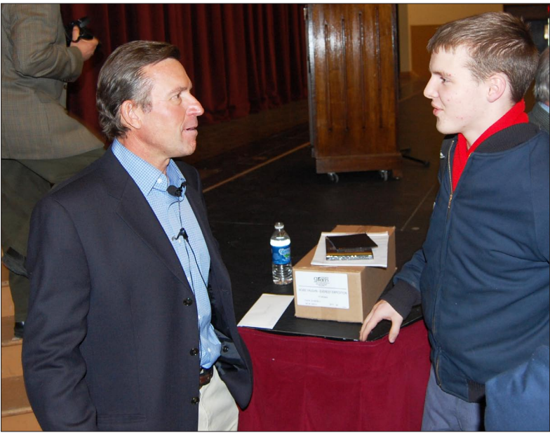
World renowned mountain climber Ed Viesturs chats with a cadet after Viesturs' lecture at Culver Academies' Eppley Auditorium.

them wisely. That principle has driven Ed Viesturs' approach to decision-making at altitudes over 20,000 feet, where pushing beyondboundaries of safety and survival has cost other climbers including close friends of Viesturs - their lives. His message for students and faculty at Culver Academies' Eppley Auditorium Feb. 4 was one of not fearing to