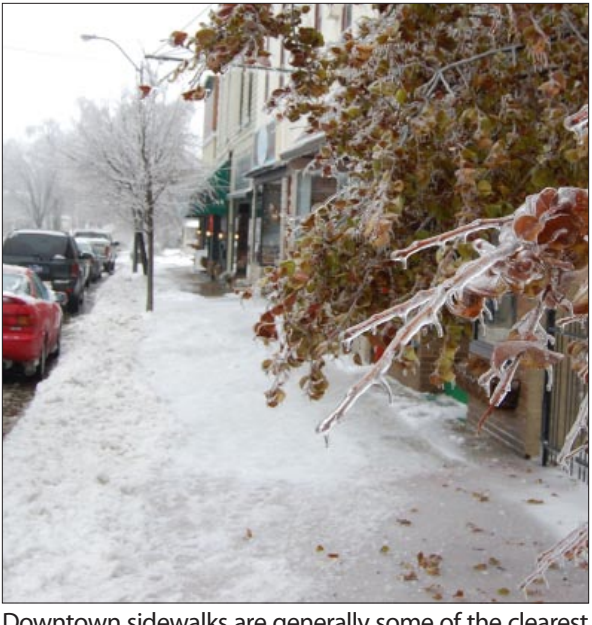
Downtown sidewalks are generally some of the clearest in town, in spite of the thin coat of ice in this December, 2008 photo. Some Culver residents are concerned about the safety of many of the town's sidewalks during the fall