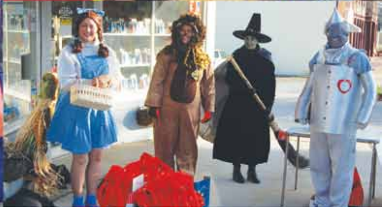
CITIZEN PHOTOS/JEFF KENNEY AND *JENNIFER LUTTRELL - LAYOUT/JEFF KENNEY