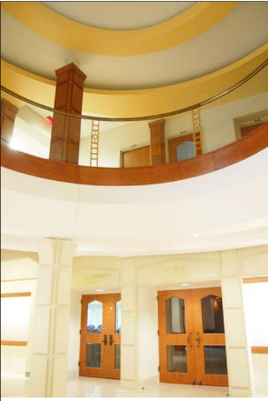
CITIZEN PHOTOS/JEFF KENNEY While still awaiting some finishing touches, this view of the rotunda area in the new Culver Academies Crisp Visual Arts Center (TOP) hints at the stately beauty of the reconfigured space. BOTTOM PHOTO: The ceramics space radically adds to the number of students who can work, as evidenced by the many wheels available.

The school's photography program is among those receiving a big boost. For several years, one of the most requested classes has been Basic Black and White Photography, Nowalk says. Introducing students to the darkroom was limited by a lab that served only seven students at a time. The new photography studio will include a darkroom with fourteen enlarger stations, a studio for shooting and lectures, and a 14-station Mac lab that replaces the current