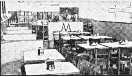
The interior of today's Cafe Max during its days as the M & M restaurant.

As John Werner also notes, Osborn owned three other two-story buildings adjacent to 113 -- hence the informal (but often used in years past) name "The Osborn Block" given to that side of the street.