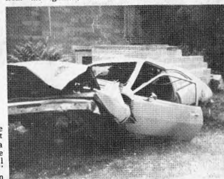
Pinto demolished in Argos accident.