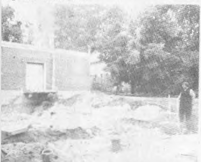
ambulance garage on the side of the Town Hall is being built by volunteers.

The new Culver - Union Twp., Ambulance will probably be delivered this week.