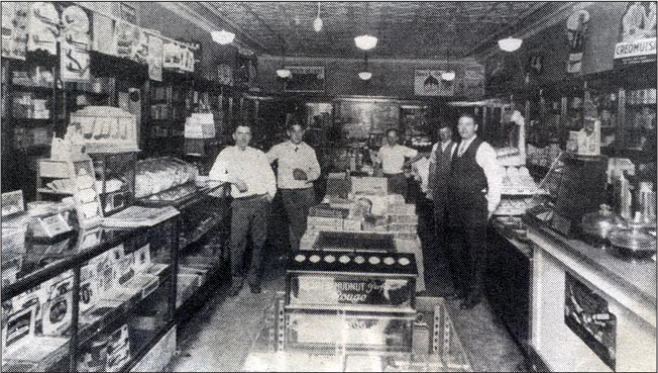
ABOVE: The interior of the Culver City Drug store, probably circa 1920s. BELOW: The store's exterior in the 1950s.