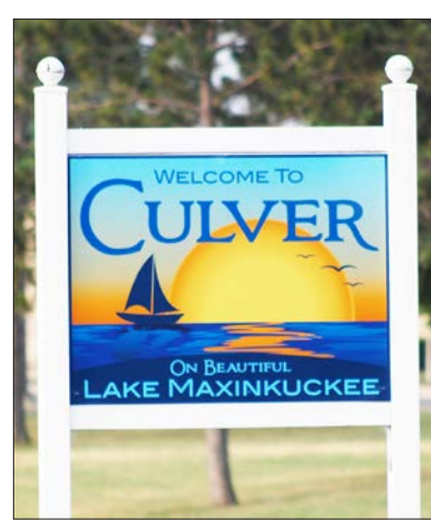
One of Culver's new 'welcome' signs, at ver Academies' wish the various entrances to town.

cated by the county. The good news -- as near as I can tell -- is that Indiana has passed legislation allowing counties to decide how to handle golf carts, much as towns have been able to since 2009. There are certain restrictions, of course, as well there should be, from the state, but regardless, it's now possible for Marshall County to facilitate golf cart travel on Academy Road. The bill, if you're curious, was House Bill 1013, and details can be found not only about that, but the locally controversial topic of "gators" and similar utility vehicles fitting into the state's definition of golf carts, on the Indiana Law Blog online. Word on the street has been that Marshall County officials have already been discuss-