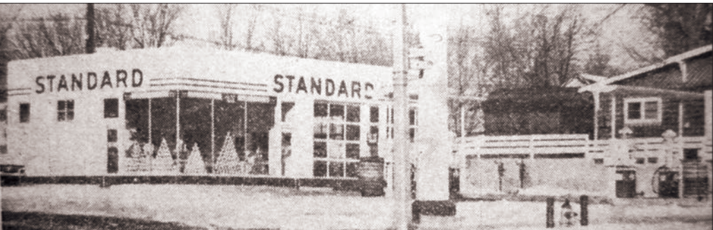
ABOVE: The then-new Standard station on Main and Washington Streets in 1958.

By Jeff Kenney Citizen editor It's hard to believe, but we're nearing the end of the line when it comes to Culver's downtown buildings in our ongoing series of "virtual" tours of historic buildings in Culver -- at least the ones on Main Street proper. That's not to say we're necessarily leaving the downtown area itself, or of course the town as a whole. There are other structures familiar to us all in the general area of downtown, of course, so we'll be taking some detours down a side street or two in coming weeks, and the itinerary for our imaginary tour of historic Culver will likely shift "uptown" (if one counts the town park area of Lake Shore Drive as "uptown" -- I recently heard tell that that area is "mid-town," and the business district on the northernmost side of town, including Park N' Shop and others, is "uptown." It's hard to get these things straight in the sprawling metropolis that is Culver, Indiana!). 203 N. Main St. We're not done with Main Street downtown yet, however. In our previous installment, we time warped to the days when Culver's Methodist Church occupied the land at the southwest corner of Main and Washington Streets. This week we'll stroll across the street to the north, which