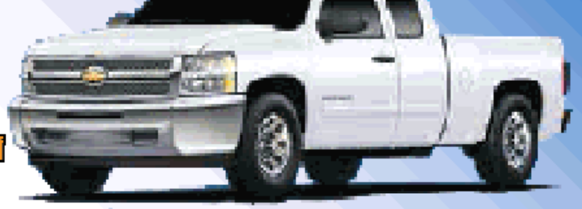
Includes rebate, Trade bonus, All Star savings and All Star bonus