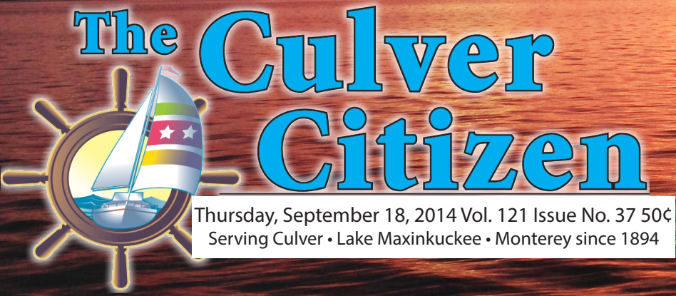
Sunset on a Culver summer...