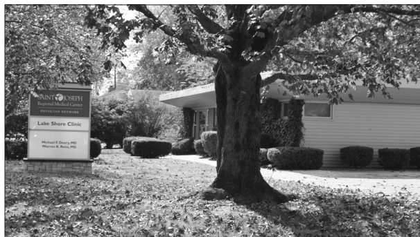
The Lake Shore Clinic as photographed in 2011, when it officially became part of the St. Joseph Physicians Network.

The clinic's location also situates it at the edge of the next Culver "business district" we'll be examining in coming installments of this series. Stay tuned.