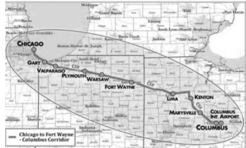
The proposed route for the CSX rail line.

Projections for the rail line estimate that the system will create more than 26,000 jobs. Household income is projected to increase by $7.1 billion in 2012 dollars, with property values estimated to an increase of $2.6 billion