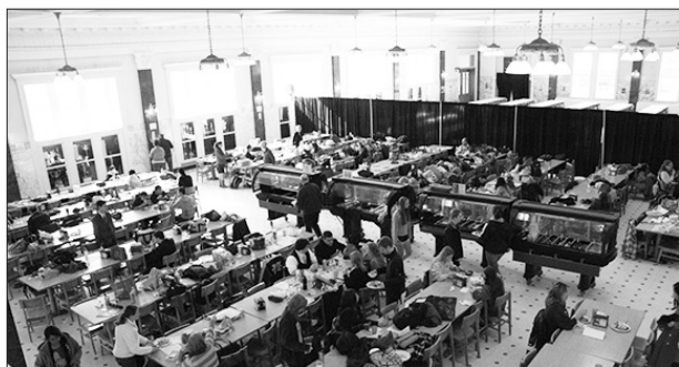
LEFT: The Lay Dining Hall served as base camp for the 500 speech competitors participating in the Northam Invitational Saturday.