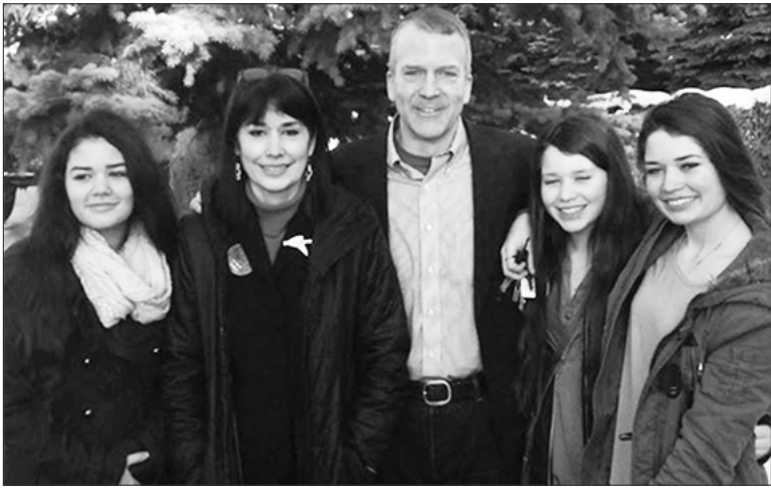
The Dan Sullivan family photo from his election committee's Facebook page.

Republican Dan Sullivan (Culver Military Academy class of 1983) became the first Culver Academies alumnus to win a United States Senate race when he defeated incumbent Democrat