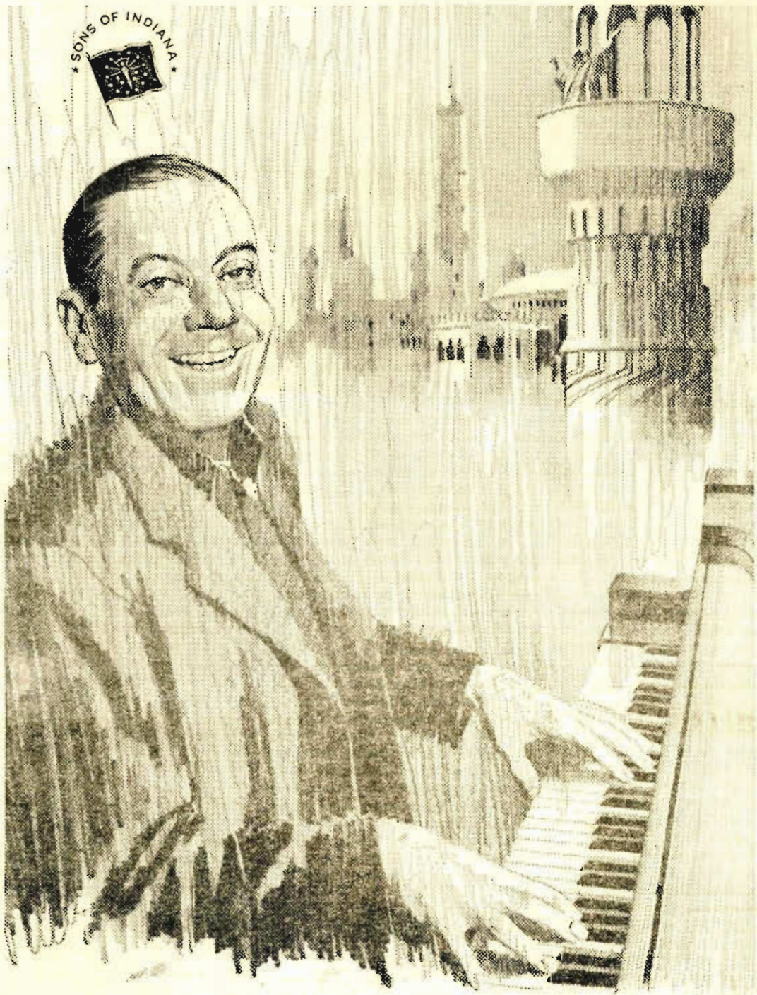
Cole Porter, born 1891, Peru, Indiana