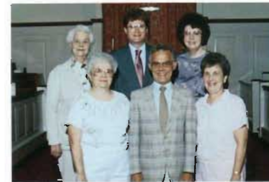
Council on Ministries