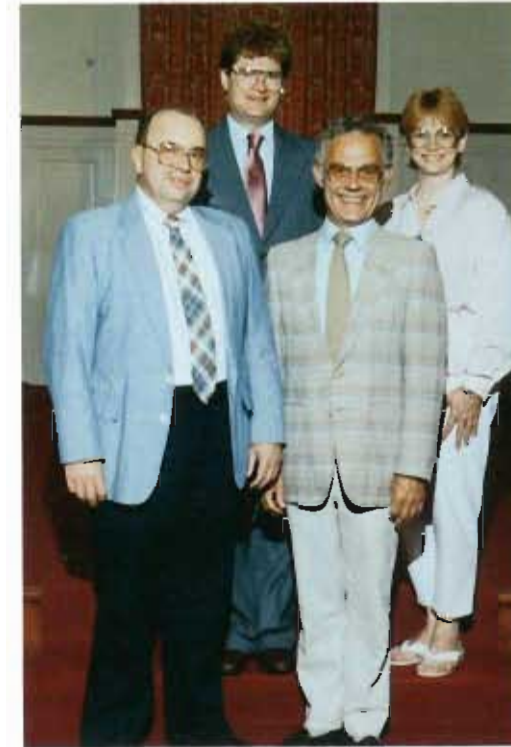
Pastor Parish Committee