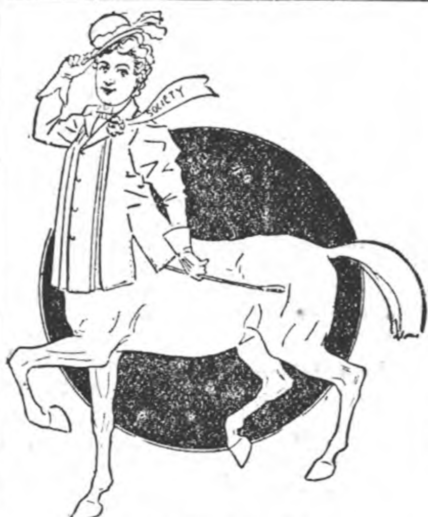
THE CENTAUR OF TO-DAY.

Ten thousand enthusiastic Chicagoans gave emphatic approval to their first horse show in the beautifully decorated and brilliantly illuminated Coliseum. Society on the opening night filled the boxes and graced the spacious promenade which encircled the right. It was full an hour