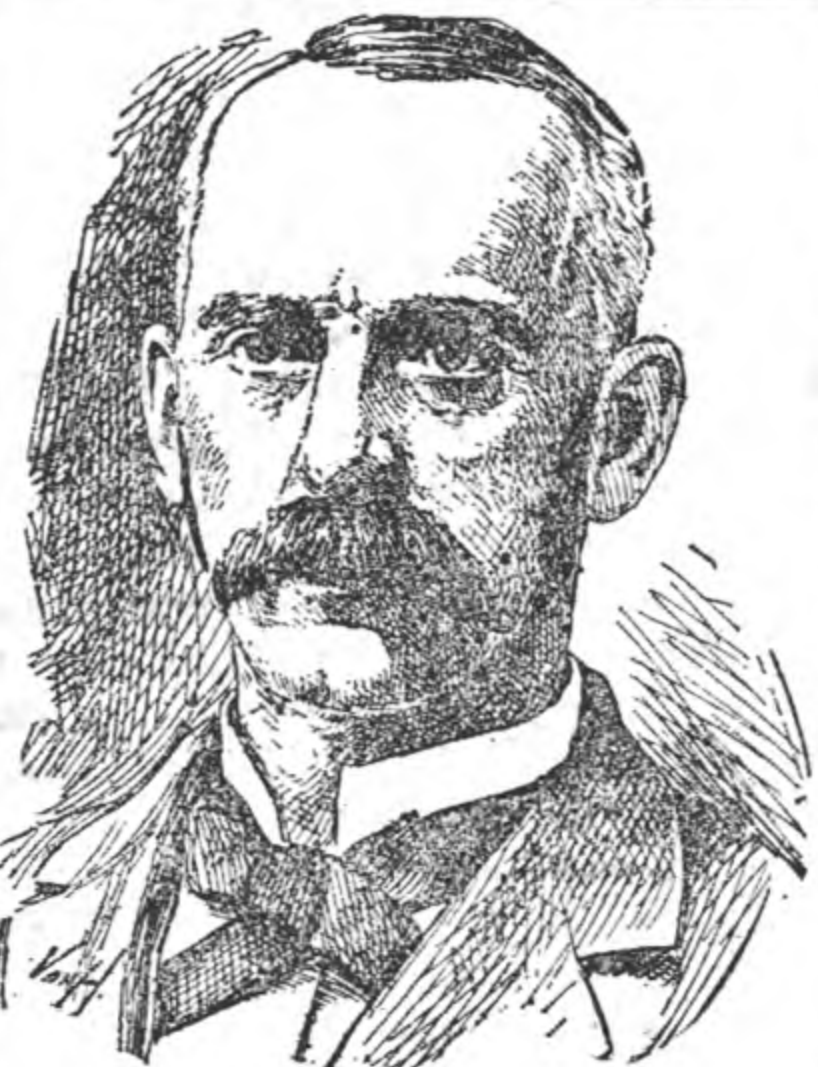
LEALIE M. SHAW. Republican Governor-Elect of Iowa.

Meantime, the managers at both the Democratic and the Republican State headquarters claim the State. The Democrats claim the election of Chapman for Governor, and their State ticket on such a close margin that it will require the official figures to determine the plurality. Chairman McConville claims that the Democrats will have a majority of seven