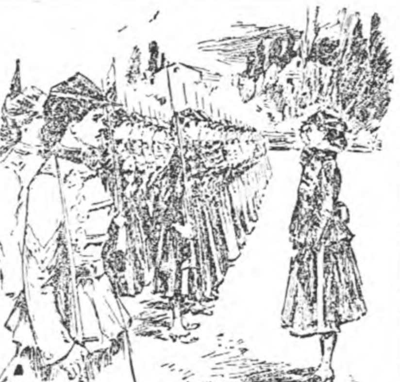
MILITARY COMPANY OF WOMEN.

The first military organization composed entirely of young women was formed in Atlanta some weeks ago, and astonished the Secretary of State