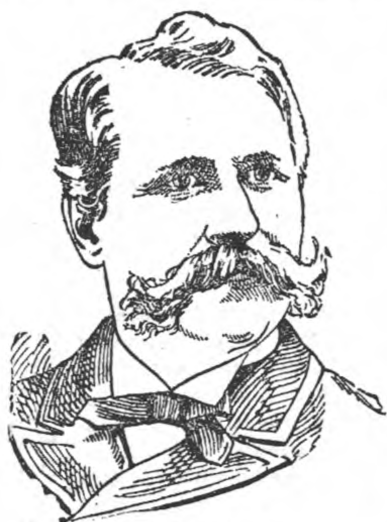
ASA S. BUSHNELL. Republican Claimant of the Ohio Gubernatorial Office.

of between 30,000 and 50,000 is given. The greatest surprise of the returns are the great gains made in the Assembly by the Democrats, many of them being in counties and districts where there was no expectation on the part of the Democratic managers of winning. Republicans explain these gains by attributing them to the heated municipal campaigns and the trading of votes. Early returns indicated that the Republicans will still control the Assembly by a largely decreased majority. More surprising, perhaps, than the returns on the State and Assembly district tickets were results of the municipal campaigns in the large cities. New York, Buffalo, Rochester, Binghamton, Syracuse, Utica, Albany, Troy and Schenectady elected Democratic Mayors. In Al-