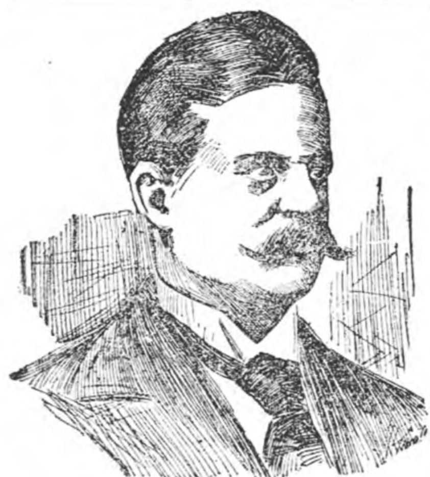
ROBERT A. VAN WYCK. Chosen Mayor of Greater New York.

Though the elections were for the most part for offices of little national importance, the result was awaited with considerable interest. In Ohio, Virginia, Iowa, Pennsylvania, Kentucky, New York, Nebraska and Massachusetts the fight waged fiercely. Ohio and Iowa elected Governors. In Maryland and Ohio a special national interest was involved on account of a United States Senator having to be elected from each of those States. Great interest attached in Ohio, Maryland and New York. In Ohio, the Democrats endorsed the Chicago platform, and the silver forces contended for the establishment of their doctrine and the election of a Senator. The Republi-