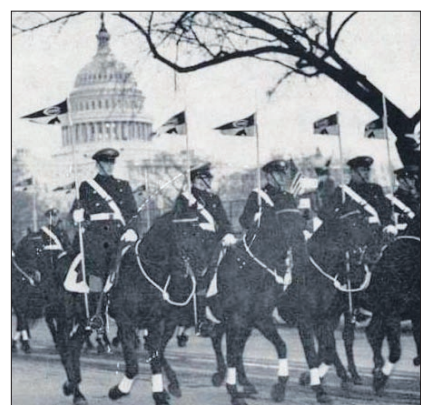
The Troop in the 1965 inaugural parade.

Eventually it was decided 60 flags was the number,