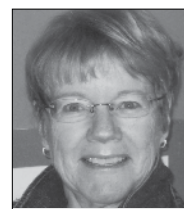
Right: this week's mystery citizen.