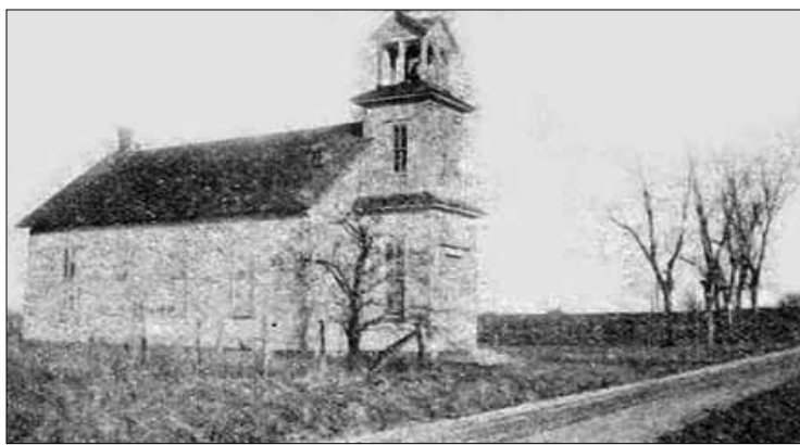
The Washington Evangelical Church in days gone by, prior to its 1939 demolition.