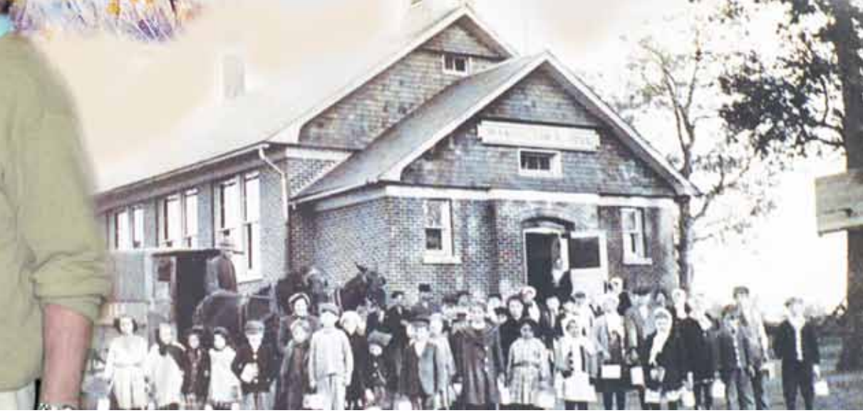
KLINE PHOTO PROVIDED - *ANTIQUARIAN AND HISTORICAL SOCIETY OF CULVER - **COURTESY ESTHER POWERS MILLER - DESIGN/JEFF KENNEY