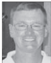
Guesses may be emailed to citizen@culcom.net,