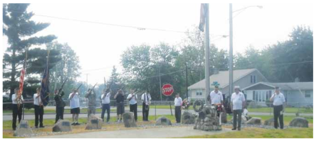
Members of Culver's VFW Post 6919 salute fallen American veterans at Culver's annual Memorial Day at the Culver Masonic Cemetery.