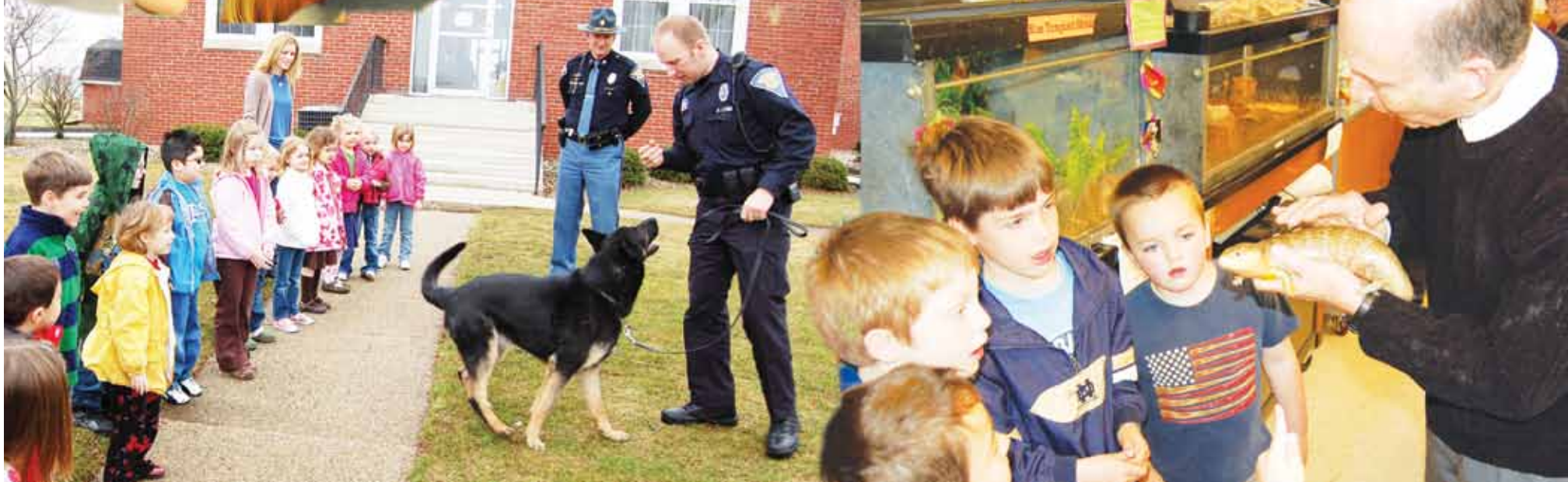
CITIZEN PHOTOS - LAYOUT/JEFF KENNEY