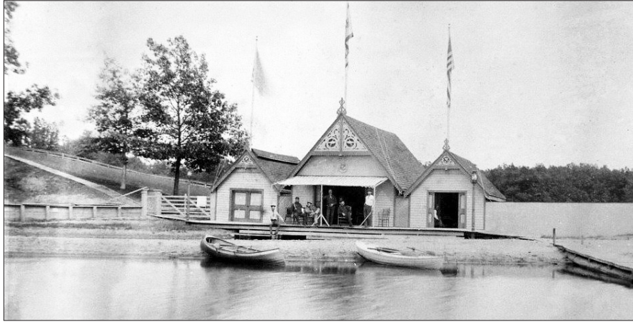
The photo above shows the Halcyon Villa, taken from the pier side (the flag flying above reads, "Halycon.")

Questions may be directed to 574-842-3606, or online via www.bikebarnculver.com .