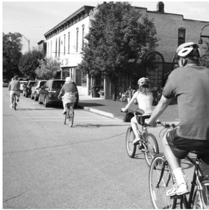
Rides in last year's bicycle tour of historic sites in Culver.

The Bike Barn, at 103 Lake Shore Drive in Culver, will once again team up with the Antiquarian and Historical Society of Culver for a bicycle tour of the town of Culver on Saturday, June 18, starting at 9:30 a.m. at the Bike Barn.