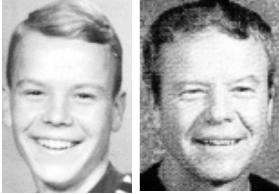
LEFT: Last week's Mystery Citizen, be emailed to culvercitizen@gmail.com or then and now. ABOVE: This week's Mystery Citizen. Call the editor at 574-216-0075.