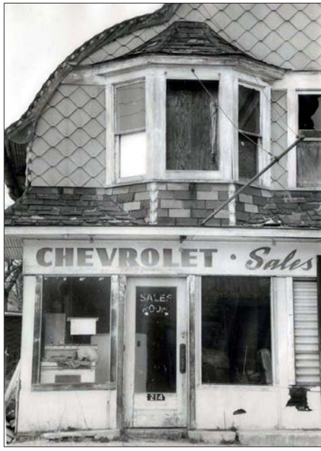
LEFT: 214 E. Jefferson -- today part of the Bayside Condominium complex -- still showing evidence of the old Snyder Chevrolet dealership there. The building was torn down in 1996. BELOW: 214 E. Jefferson circa 1922, when it was home to McClane and Son livery and feed.

Bayside, of course, occupies more than just the 214 East Jefferson locale, but extends over several lots, including the old Ferrier and Son lumberyard at 316 E. Jefferson.