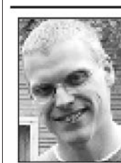
View from Main Street

Another Halloween is approaching, and as I've shared in this column in years past, I have some great memories of Halloween's past in Culver, primarily centered around many a kid's cherished Trick-or-Treating. I was never one for the more recent, truly dark, macabre, or gruesome manifestations of the Eve of All Saints Day (as our ancestors would have regarded it), and let me say at the outset of this column that I've also never spent much time traipsing around looking for haunted spots.