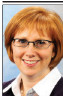
HOOSIER HABITAT: EASY WAYS TO LIVE GREEN BY MARIANNE PETERS

Some friends of mine own a small storage facility. Every once in a while, they have a garage sale to dispose of the things people have left behind. My friends have opened abandoned units to find taxidermic deer heads, family pictures — including wedding pictures (usually stored along with divorce papers), loose change, clothes, furniture, televisions, mattresses, tools, cassette tapes and CDs, half-empty bottles of shampoo, Christmas decorations, and even food.