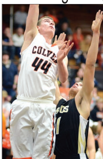
Culver Community's Bradley Beaver goes up for two against an Argos defender during a boys basketball game in Culver last week.