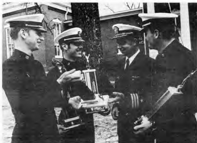
OLD MISS NAVY DRILL TEAM —The University of Mississippi Navy R.O.T.C. Drill Team is shown here, including a Culver resident. Shown, left to right, are: student