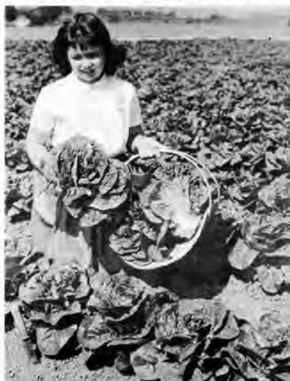
America's leading seedsmen, meeting at Atlanta, Georgia, voted looseleaf lettuce "Vegetable of the Year." Easy-to-grow and early-to-mature are some reasons for its popularity among homeowners.

When seedsmen meeting at Atlanta, Georgia, were asked to name a "Vegetable of the Year," the voting was almost equally divided between Swiss chard and looseleaf lettuce, but looseleaf lettuce finally gained the vote, taking the title away from the hybrid tomato, which won the previous year.