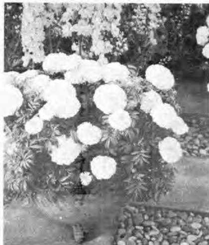
When America's leading seedsmen, meeting in Atlanta, Georgia, were asked to name a "Flower of the Year" based on popularity among homeowners across the country, American marigolds won the vote. The picture above shows a container planting on a patio.

One of the most popular flowers in American home gardens is the American (or African) marigold, and when leading seedsmen — meeting at Atlanta, Georgia — voted on naming a "Flower of the Year," the American marigold won the title. It won for several good reasons, apart from its popularity.