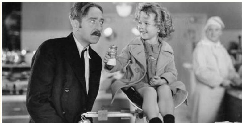
Adolphe Menjou and Shirley Temple from Little Miss Marker .