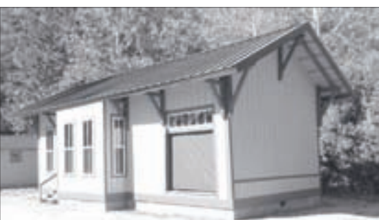
Leiters Ford depot in its heydays (left) and restored at Delphi today (right).

The origin of this 1884 structure was in Fulton County, serving train passengers in Leiters Ford, along the Tippecanoe River. The railroad line was originally known as the Chicago and Atlantic Railroad and in the 20th century was known as the Erie Line.