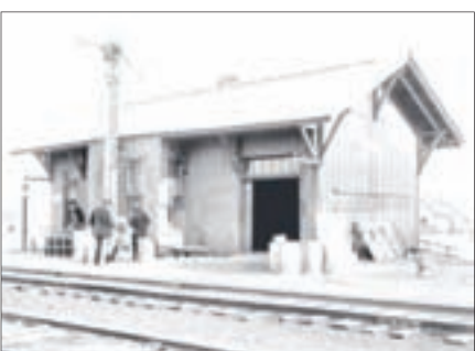
ABOVE: The original