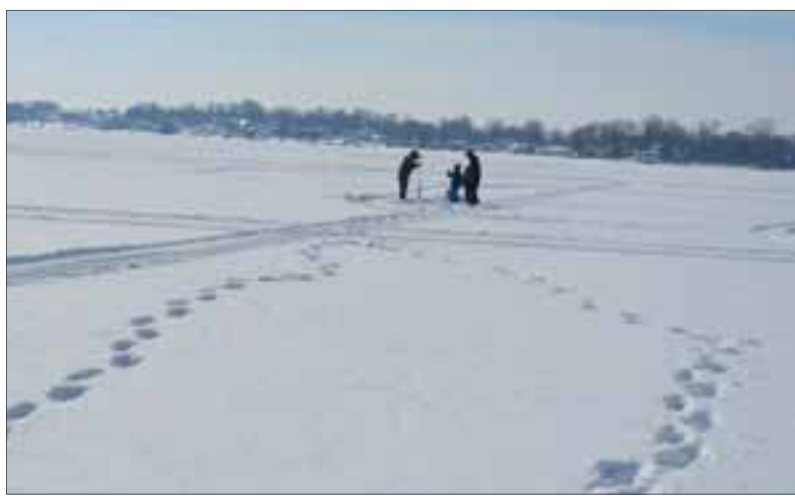
Ice fishing on Lake Maxinkuckee in 2014. Will this season see a chance to repeat the fun?

"Therefore, before any ice can be formed the whole lake must be cooled to a temperature of 39.2. Since the