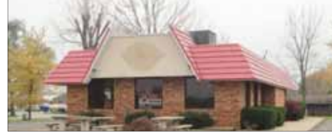
The former site of Culver's Dairy Queen, at 18619 State Road 10, is planned for development of an Ace Hardware store later this year.